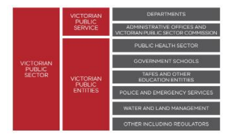
Figure 1: the composition of the Victorian public sector

Contractors or consultants (including those engaged through an employment agency) are required to comply with the Code and uphold DET's Values, if they: