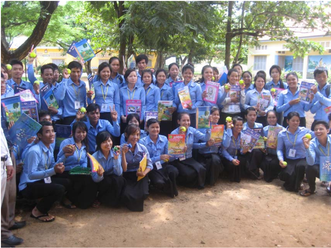
Student Teachers at Kampang Thom (Teachers Across Borders Program)